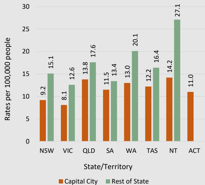
Suicide rates by region, 2014-2018, Australia, 2018 (update to Figure 8 therein)